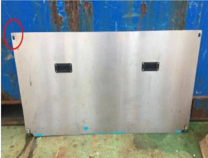
Removable Panel 1 - Stainless steel panel hanging by the upper left locating pin