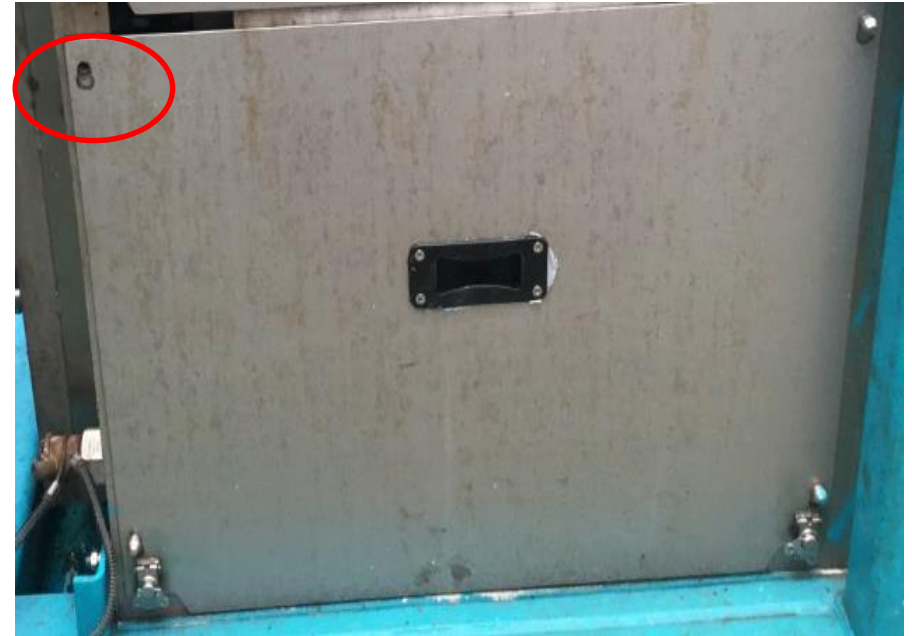
Removable Panel 2 – The upper left locating is missing