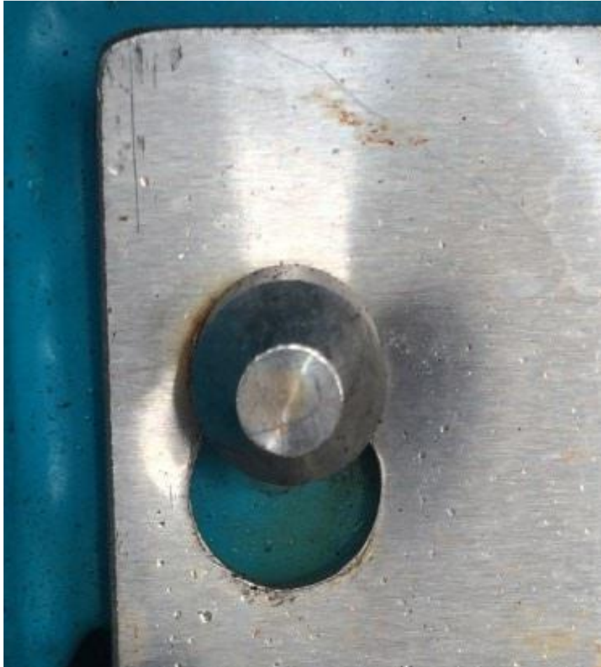
Upper Securing Locating Pin