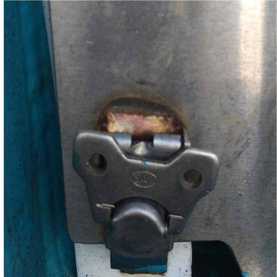
Lower Securing Clasp