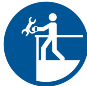
ABB - BLOCK – 60 FSA-2021-062