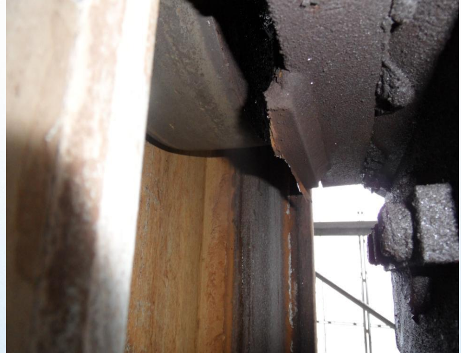
Dolly Roller Plate Position After.