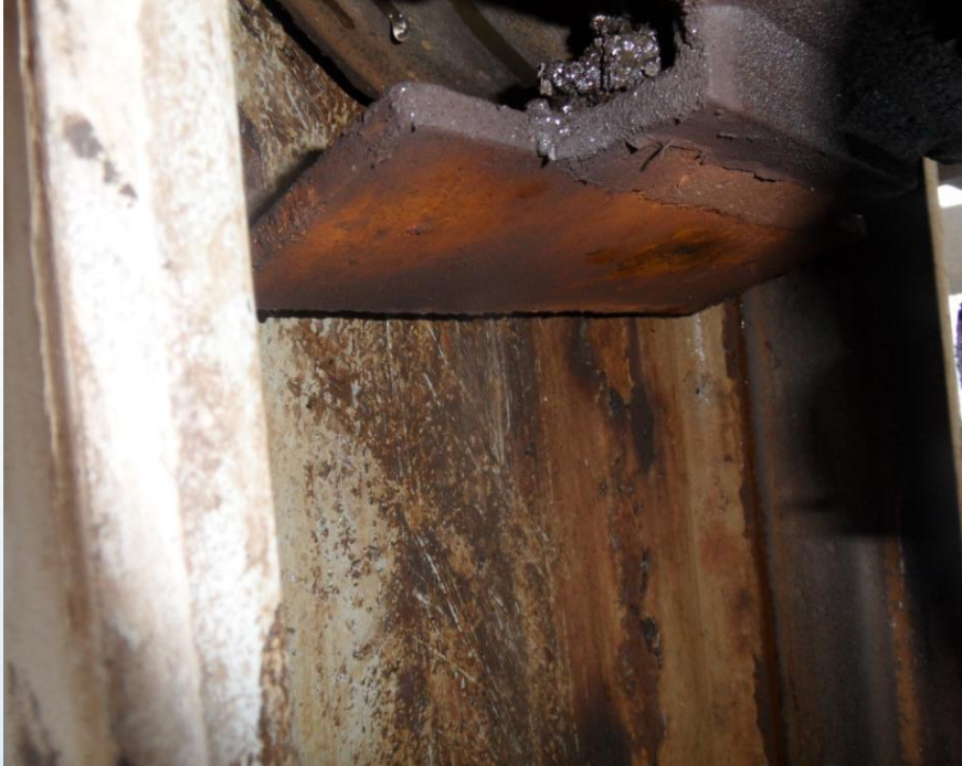
Dolly Roller Plate Position Before