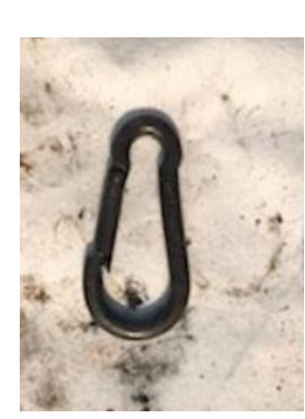
The single-action carabiner from the incident