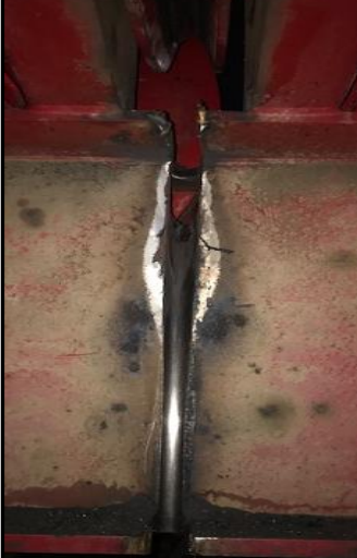
View of drill line cutting through I-beam