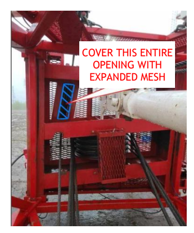
View of engineering guard to prevent improper spooling of drill line

Help industry by sharing lessons learned from an incident. Submit your Safety Alert.