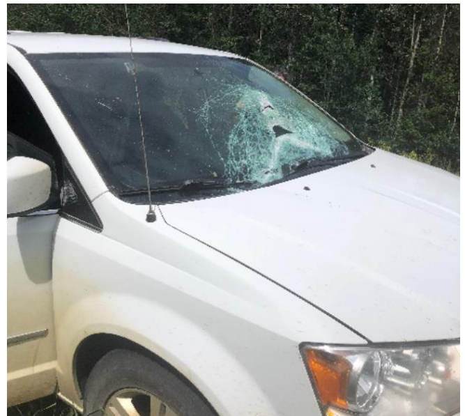
View of damaged third-party vehicle